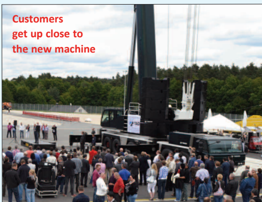
Customers get up close to the new machine