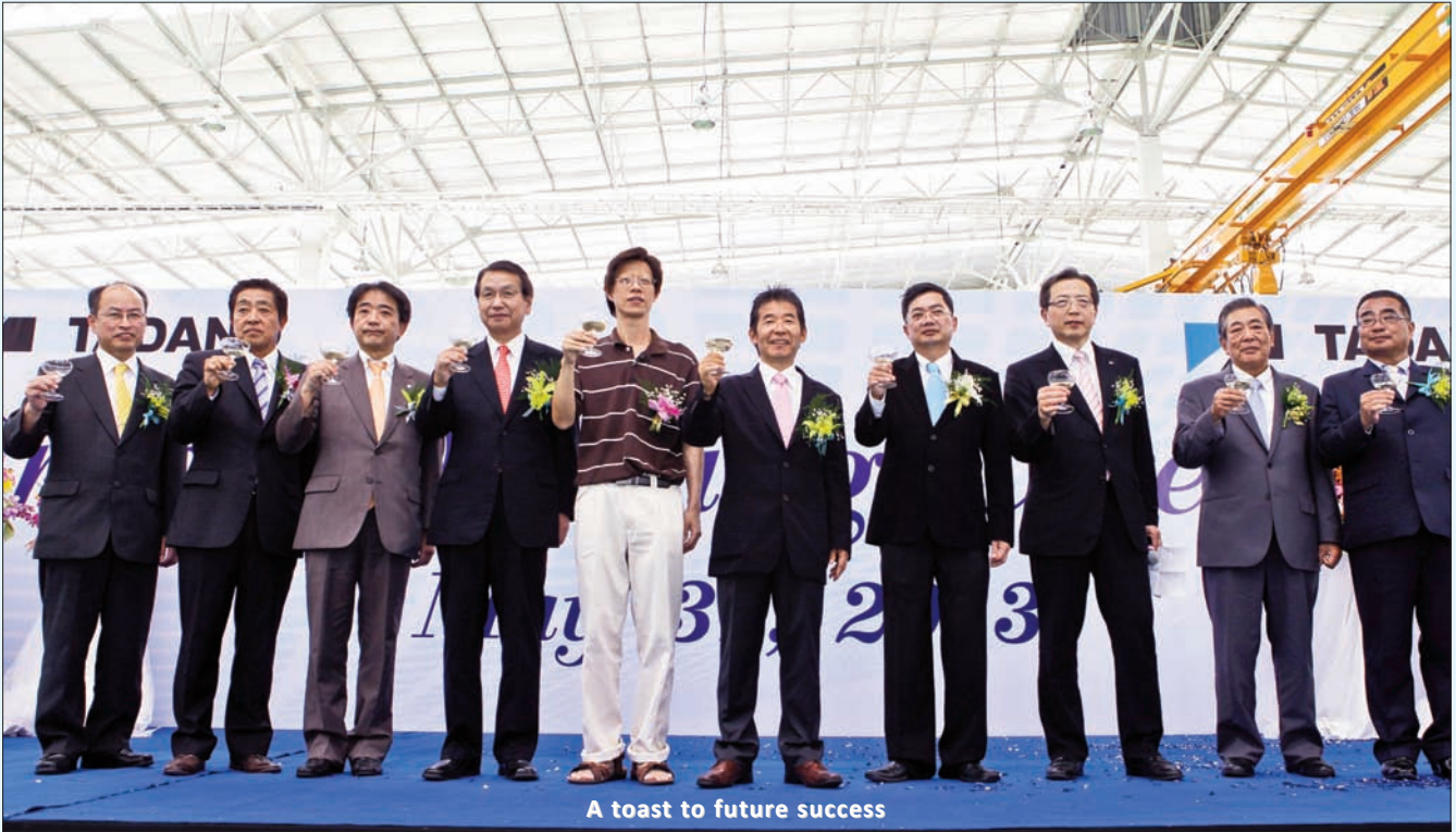
A toast to future success