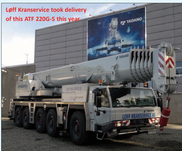
Løff Kranservice took delivery of this ATF 220G-5 this year

The Knutsen Maskin group is also the Tadano dealer for Sweden and Denmark as well as Norway, having acquired