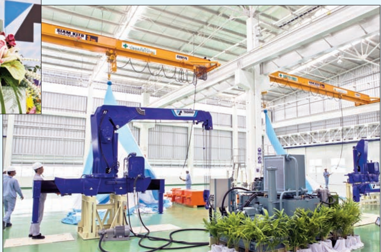
First loader crane produced at the new plant