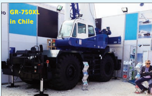
GR-750XL in Chile

Exponor, held every two years, is located close to the operating sites of several global mining companies. This year's event attracted 35,000 trade visitors, according to the Antofagasta Industrial Association, which organises it.