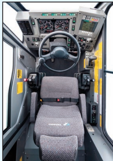
The new 145-tonne RT has state-of-the-art controls and a six-section 61m (200ft) main boom

The new three-axle carrier has improved manoeuvrability to navigate confined job sites with 6x4x6 drive, plus four steering modes and a turning radius of 9.9m (32ft 6in), with six-wheel steer. For ease of transport, the self-removable counter-