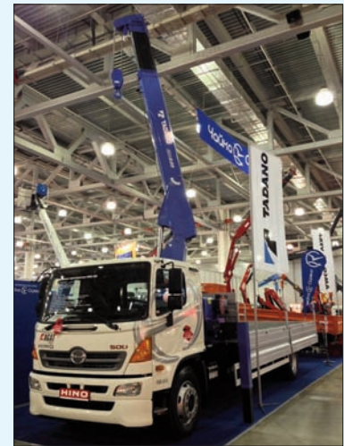
Tadano cranes could be found both inside and out at Moscow's CTT fair