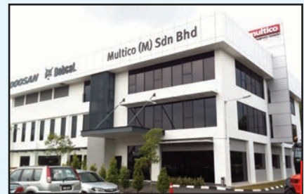
Multico offices in Bandar Baru Bangi, on southern fringe of Kuala Lumpur

imposition of a new sales tax, has led to crane sales slowing down in recent months but there are massive engineering projects under construction that are sure to contribute to an upturn before too long. For example, the Malaysian state oil and gas company Petroliaam Nasional Berhad (Petronas) is developing a US$16bn refinery and petrochemical integrated development project (RAPID) in Southern Johor as part of the $27bn Pengerang Integrated Petroleum Complex.