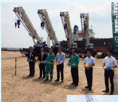
Handover of eight GR-500EX rough terrain cranes to customer MMHE