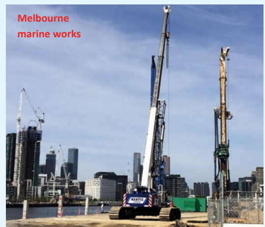
Melbourne marine works

Universal Cranes, one of the largest privately owned crane hire companies in Australia recently took delivery of a Tadano Mantis GTC-400EX.