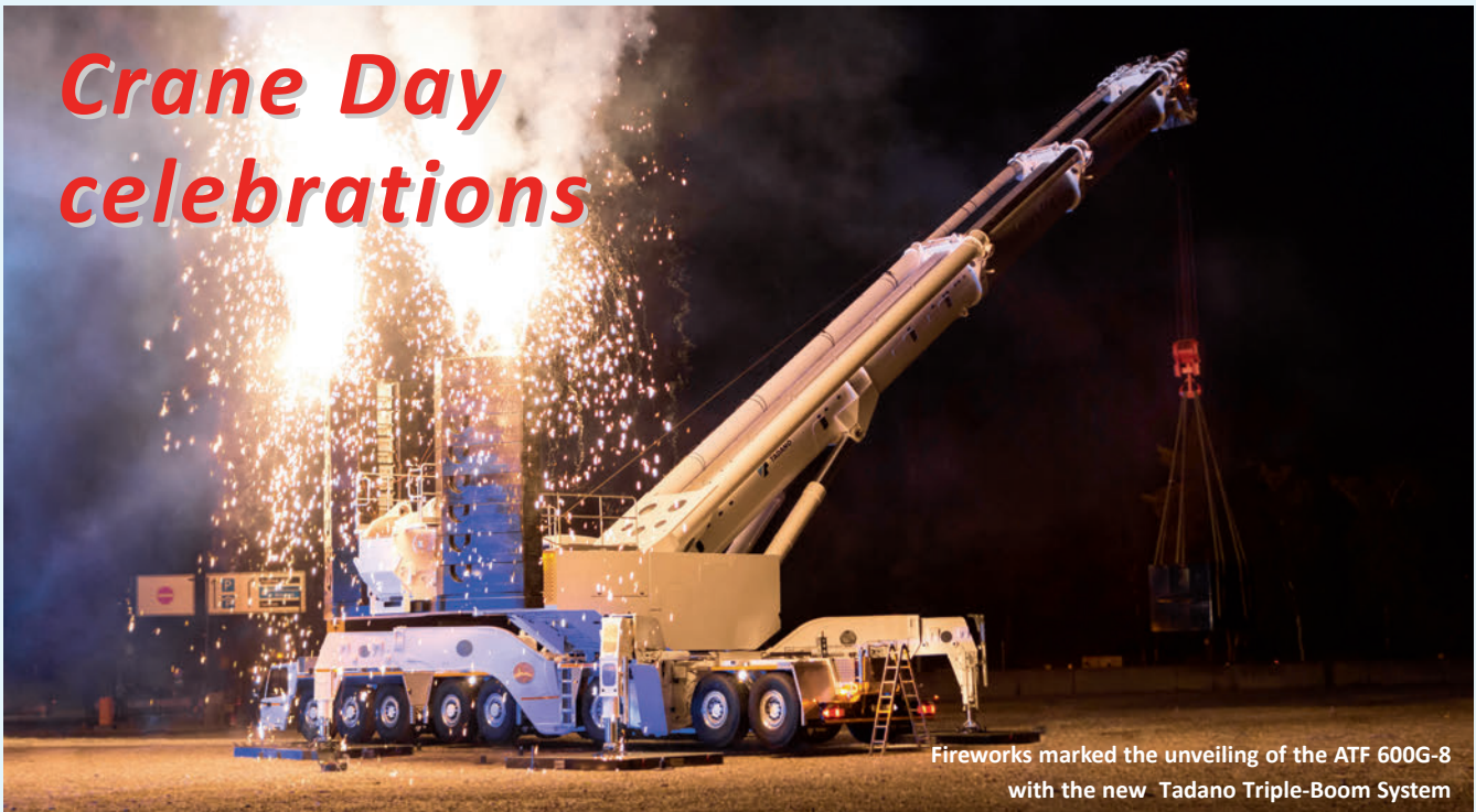
Fireworks marked the unveiling of the ATF 600G-8 with the new Tadano Triple-Boom System

There were more than a thousand guests to witness the global unveiling of the innovative ATF 600G-8 on the evening on Friday 12th June at the Nuremberg Fair.