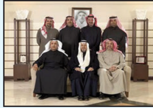
The Al-Babtain board and, below, its logo

Kuwait's open economy and strategic location at the north of the Persian Gulf, bordering Saudi Arabia and Iraq, make it a significant commercial hub in the region. Despite the recent decline in oil prices Kuwait, along with the rest of the Middle East, remains a significant and important market for Tadano. Just last year, for example, one Kuwaiti customer alone – Integrated Logistics – bought 25 units of the first GR-800EX rough terrain cranes in the country, along with 20 of the 50-tonne GR-500EX rough terrain and a pair of 60-tonne GT-600EX truck cranes.