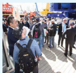
Below: A visitor is clearly impressed