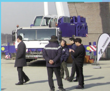
Visitors get a close look at the Tadano ATF 110G-5