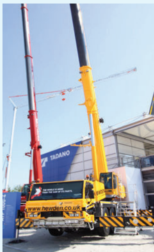
The ATF 100G-4 (above) was on its way to UK customer Hewden, while the ATF 70G-4 (below) was pre-sold to Rigar of Argentina

"At present, we are testing the tiltable