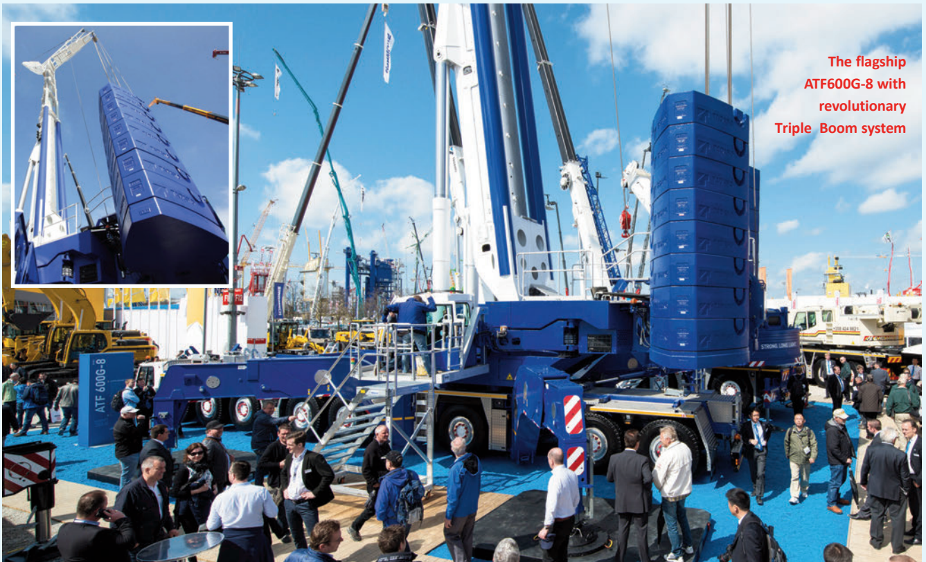
The flagship ATF600G-8 with revolutionary Triple Boom system

the 200-tonne category and renamed as the ATF 200G-5. It can lift 200 tonnes with a counterweight of just 50 tonnes and the chart has been clearly improved in the medium radius range.