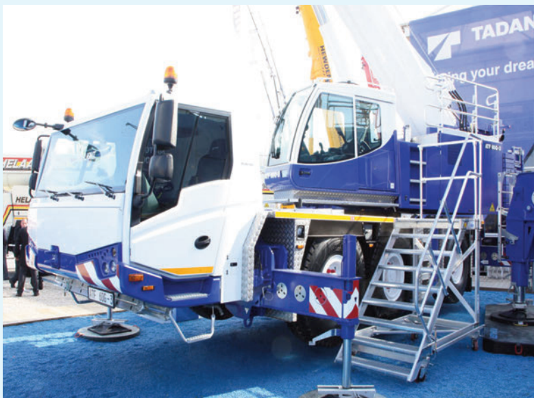
Above: The groundbreaking new 60 tonner

With the ATF 60G-3, thanks to such re-thinking, Tadano has managed to design a powerful crane with a 48.2-metre main boom that meets 12-tonne axle load restrictions without any problems. Dr Welschof says that telescoping the boom under load is possible thanks to an extremely strong telescope cylinder. As the boom reaches 48.2 metres with seven sections, the crane itself remains remarkably compact, at 11.18 metres long and is suited for lifting in spaces subject to height limitations, such as under structures.