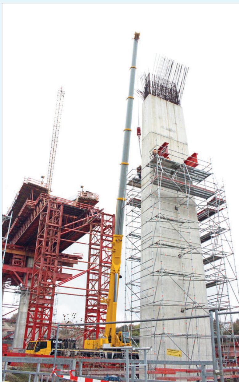
The ATF 220G-5 in operation on site during construction of the new Aurachtalbrücke bridge near Emskirchen

Dismantling the previous bridge pier was trickier, however. To lift the heavy steel scaffolding part off the falsework, it was necessary to telescope under load. "The steel beam cannot be released without telescoping and it is a well-known fact that this is exactly one of the strong points of the ATF 220G-5," Andreas Tischer points out.