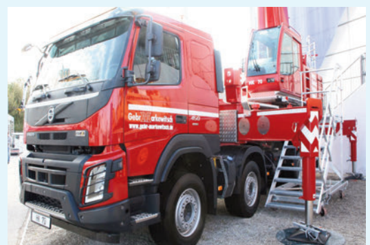
Above: The truck-mounted HK 70, rated at 70 tonnes