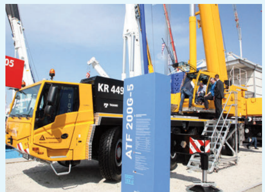
Below: The ATF 220G-5, with the new cab, sold to Welsh customer Davies Crane Hire