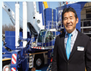
Top: The Tadano team with the ATF 600G-8