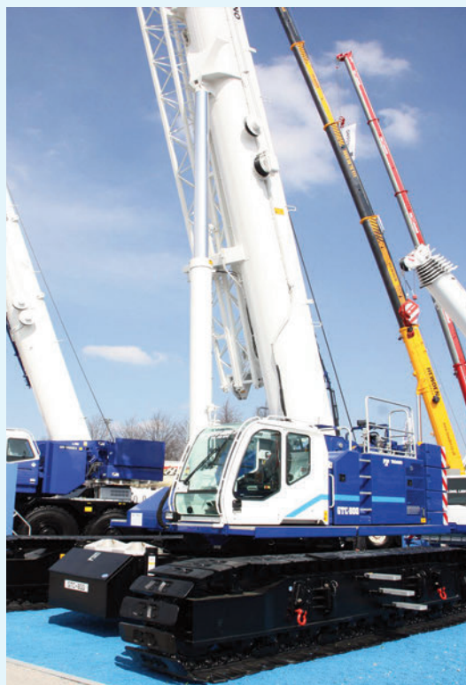
Tadano Mantis GTC-800

jib. On completion of the tests, we will take up deliveries speedily. I am confident that we will see the ATF 600G-8 successfully in operation in 2017."