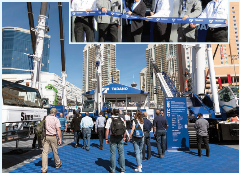
Tadano's booth at ConExpo

In this issue of Tadano Global News we report on some of the all terrain, rough terrain and telescopic boom crawler crane sales that were completed in Las Vegas during the week.