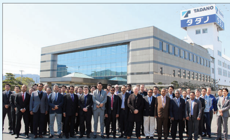
Distributors from across the Middle East met at Tadano's Shido factory

At the conference, a wide range of issues were