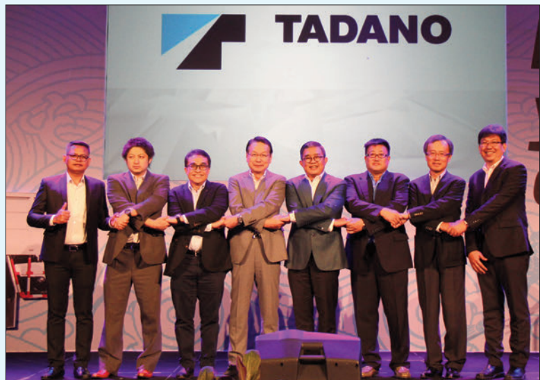
Above: Tadano and PT United Tractors join hands in Indonesia