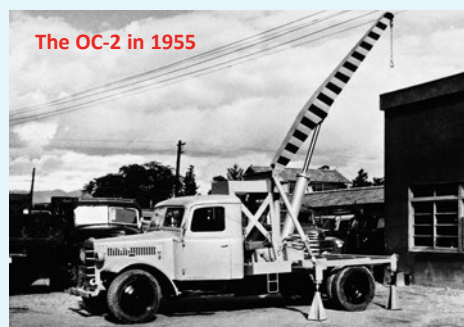
The OC-2 in 1955

We remain committed to offering products and services that are useful to society under Tadano's aspirations that have endured since the time of its founding. And today we are better placed than ever before to deliver on those aspirations.