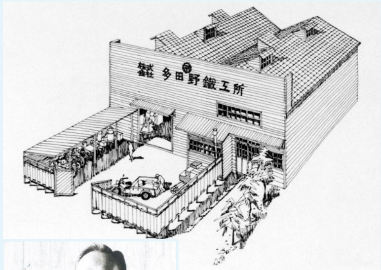
Above: the original Tadano workshop in Takamatsu

However, if that is all we do, we may survive today but will have no future beyond tomorrow. The use of