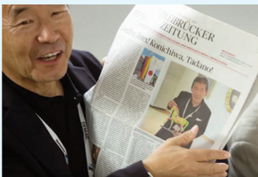
Left: ‘Goodbye, Terex! Konichiwa, Tadano!’ says the headline in the local newspaper, Zweibrücker Zeitung

As a subsidiary of the Tadano Group, the Demag mobile cranes business legal entity name is now Tadano Demag GmbH.