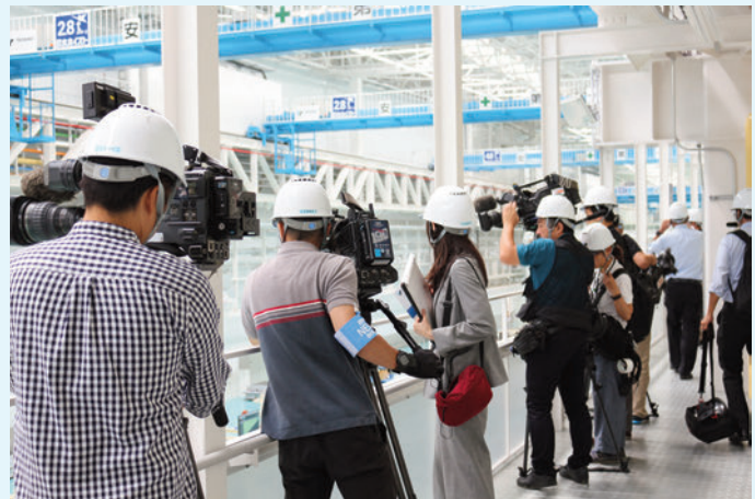
The opening of the state-of-the-art plant attracted media interest and important visitors. Shown left (l-r) are the Governors of Kagawa prefecture Takamatsu city.

The new factory has been built to support all these aims. The design is based on the concept of 'Next Generation Smart Plant', with clean and simple production lines, minimized environmental impact, reduced contamination, more robots and more use of electronic data storage.