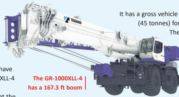
The GR-1000XLL-4 has a 167.3 ft boom

GR-800XL-4 has an all-round stronger chart than the previous 75 US ton model (GR-750XL), making it one of the most versatile and well-balanced rough terrain cranes in the industry.