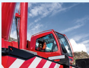
The ATF 200G-5 on top of the Kaunertal Glacier in the Tyrol

“The wind really knows how to blow up here,” he says. “In fact, it caused us to stop working several times. There were two days when we couldn’t do anything at all, and other days when we had to contend with snowfall and frost. Fortunately, the 200-tonner boasts a super comfortable superstructure cab with a state-of-the-art multifunction touch-screen display and cameras. It’s such a huge help to know I can rely on these with every lift.”