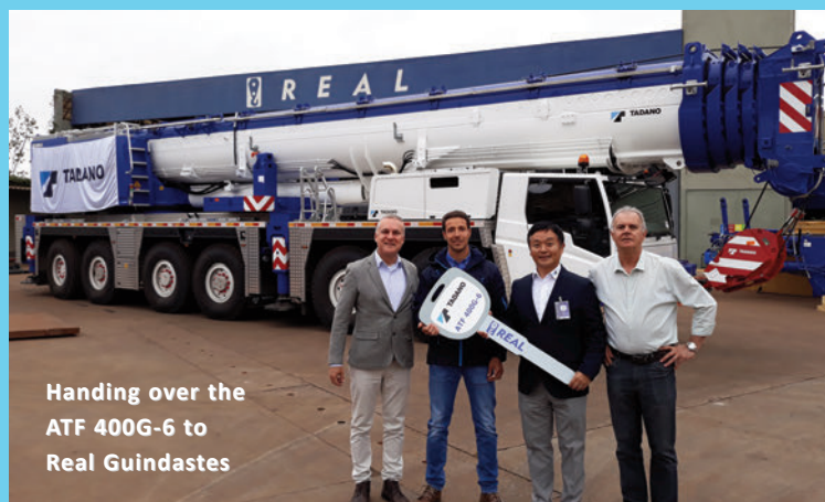
Handing over the ATF 400G-6 to Real Guindastes

The handover of the crane last September involved technical briefings and training from Tadano professionals from Brazil, Germany and Japan.