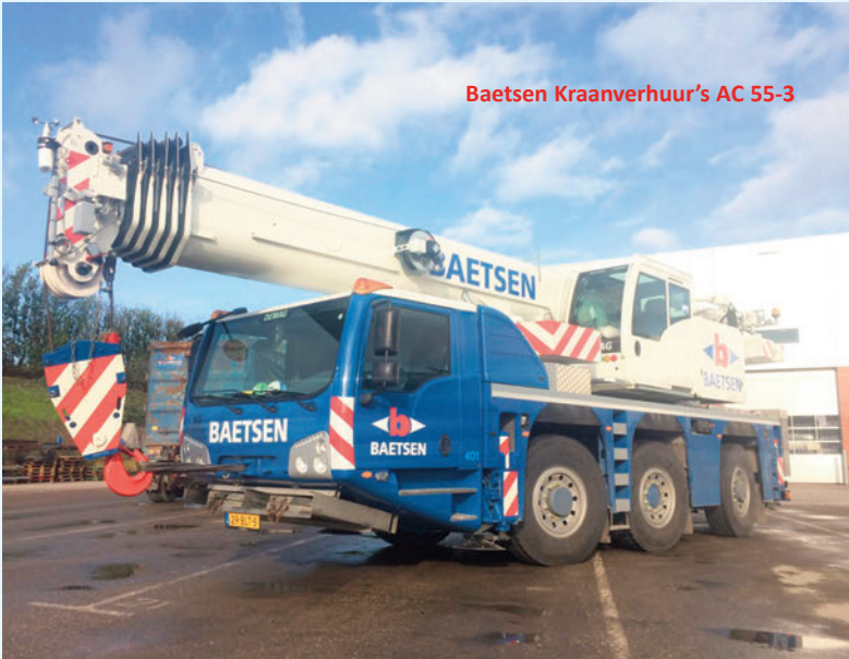
Baetsen Kraanverhuur's AC 55-3