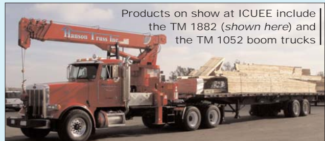
Products on show at ICUEE include the TM 1882 (shown here) and the TM 1052 boom trucks