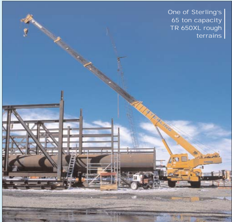
One of Sterling's 65 ton capacity TR 650XL rough terrains

Residual value is also important to fleet